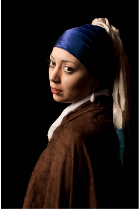
A Study of Light via The Masters Photo 156 Portfolio w/Ron Zak